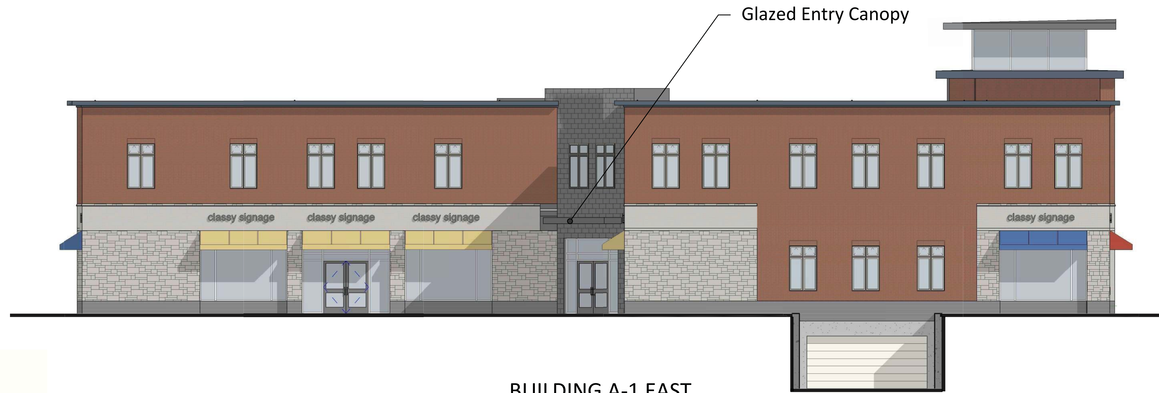
BUILDING A-1 EAST