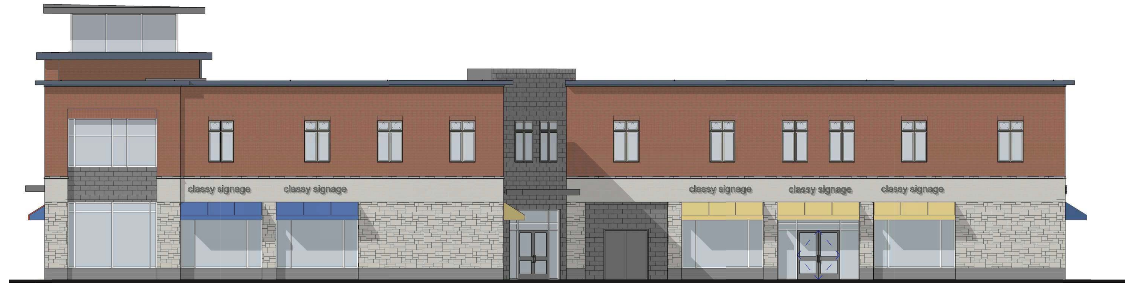
BUILDING A-1 SOUTH